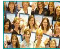
Mentoring a Team